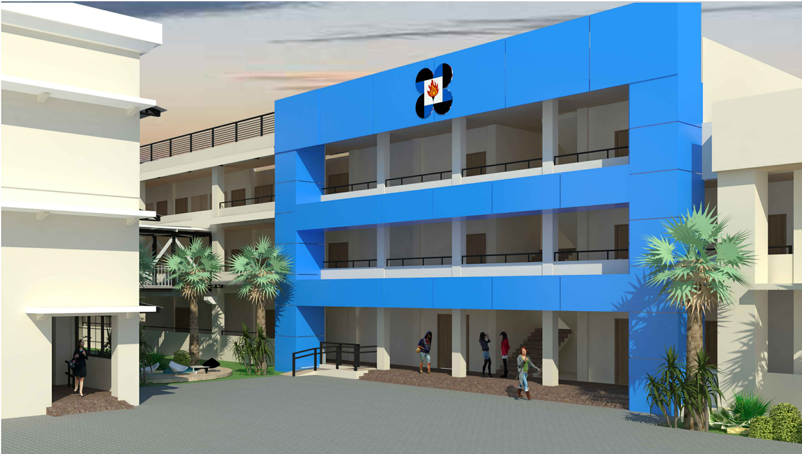
1 PERSPECTIVE CS-1 CS-1 NTS